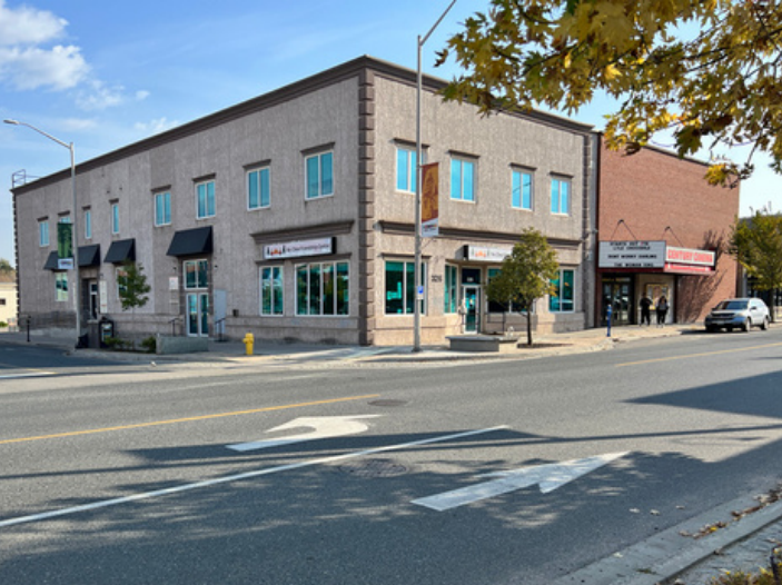
The Friendship Centre

The Ne-Chee Friendship Centre is a not-for-profit Centre that is mandated to serve the needs of all Indigenous people regardless of legal definition. Ne-Chee currently offers 22 programs and continues to partner with community programs to ensure our client's needs are met while transitioning or living in an Urban Area.