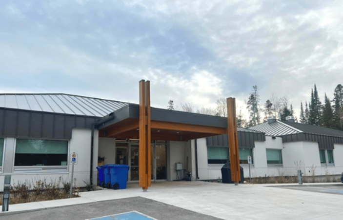
The Bail Residency