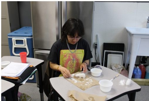
Above: Students made an alabaster polar bear carving with