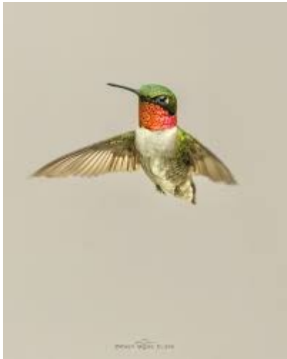
Nenookaasi — Hummingbird