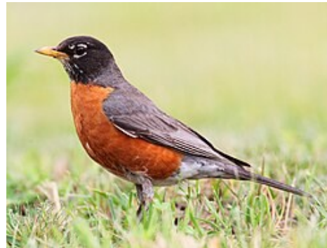
Opichi (Apichi in some Dialects) — Robin