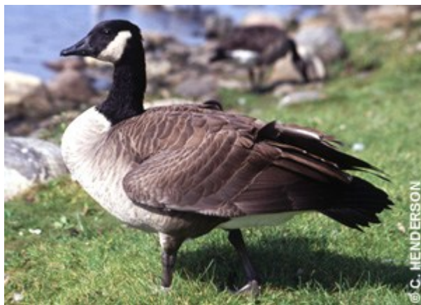
Nika — Goose