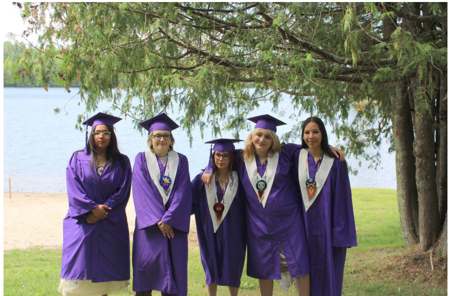
Right: 2025 Graduates of the Indigenous Student Success Program