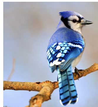
Diindiisi — Blue Jay