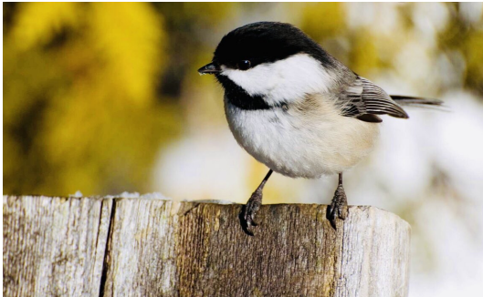
Gijigijigaaneshiinh - Chickadee