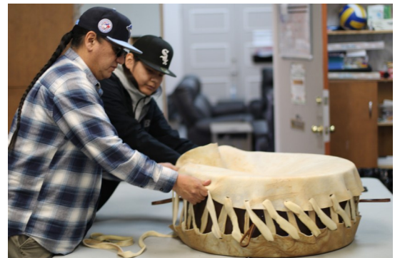
Left: Teachers and students enjoy a visit to Rushing River while working on their photography skills.